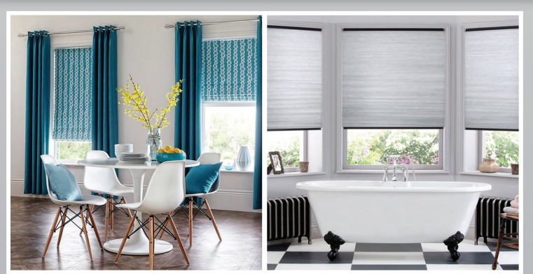
BLINDS MADE TO MEASURE

COMPOSITE DOOR & SASH WINDOW SPECIALISTS